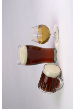
Make your own drinks