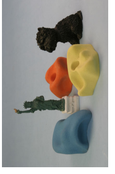
Robnor Casting Resin